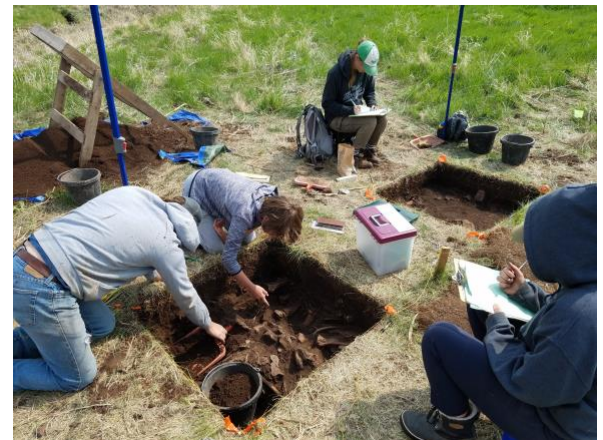
Image caption: Students uncovering bison bones at the Bergstrom kill site.

For millennia, persistence of bison–human systems was supported by spatial heterogeneity, episodic site use, and the capacity to reorganize as drought changed resource distributions. Modern bison management within fixed boundaries often lacks that flexibility. Strategies that promote landscape heterogeneity, maintain habitat connectivity, and tolerate variability in herd size may help contemporary systems weather future drought.