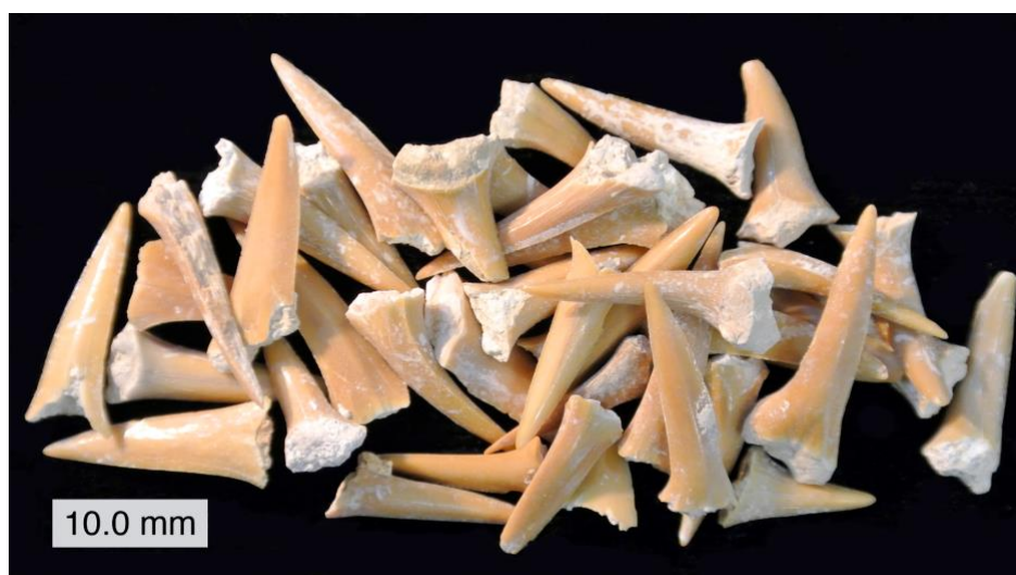
Image caption: Fossilized shark teeth are abundant in the fossil record.

Fossil shark teeth contain the strontium. Strontium is an element that is present in the ocean and is stable in sea water at any given time. The ratio of isotopes Strontium-87 to strontium-86 shifts over millions of years due to climate, tectonics, and magnetism. This change allows it to be used to date calcium carbonate shells and teeth of marine organisms (DePaolo and Ingram 1985). The outer layer (enameloid, which is like the enamel of human teeth plus collagen fibers) of shark teeth may be more resistant to alteration than other tooth material (e.g. dentine). This method of dating has many applications, including for conservation paleobiology of marine organisms such as sharks (Barrat et al. 2000) and even land mammals (Killingsworth et al. 2025).