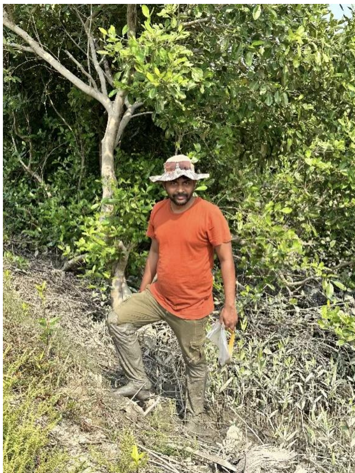
Image caption: Collection of a modern surface sediment sample for pollen analysis from a muddy vegetated wetland.

In this feature of our newsletter, we showcase members' research in the field, lab, or other settings. Please submit your "postcards" with approximately 100 words of text to us at incp@conservationpaleorcn.org